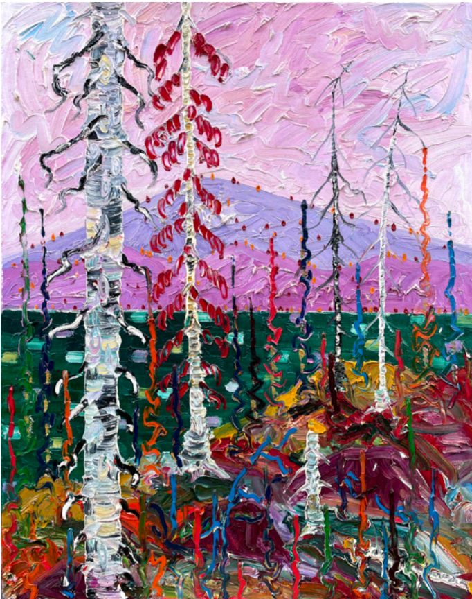
EMERALD WATERS 2017 38" x 30" Oil on canvas / Huile sur toile

*Pour obtenir un complément d'information, vous pouvez visiter notre site Web. Prendre rendez-vous avec nos spécialistes, ou venir à la galerie voir l'exposition.