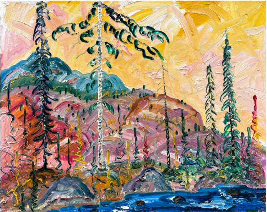
HOWELL CREEK 2008 30" x 38" Oil on canvas / Huile sur toile