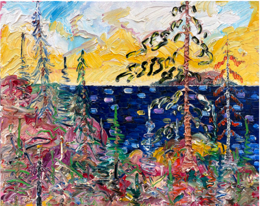
RED PINE SHORE 2009 30" x 38" Oil on canvas / Huile sur toile

exhibitions in Canada and America in addition to being collected by Art Gallery of Ontario, Robert McLaughlin Gallery, McMaster Museum of Art, Beaverbrook Art Gallery and other regional museums, and in established collections such as the Queens Silver Jubilee Collection, and the Office of the Canadian Prime Minister, and The Canadian Department of Foreign Affairs and International Trade.