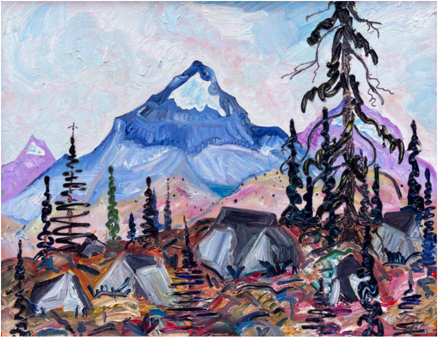
CATHERAL 2003 30" x 40" Oil on canvas / Huile sur toile