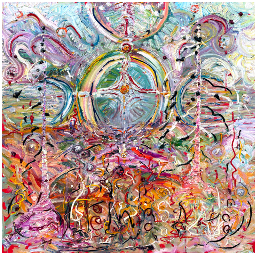
SUNDOGS 2018 60" x 60" Oil on canvas / Huile sur toile