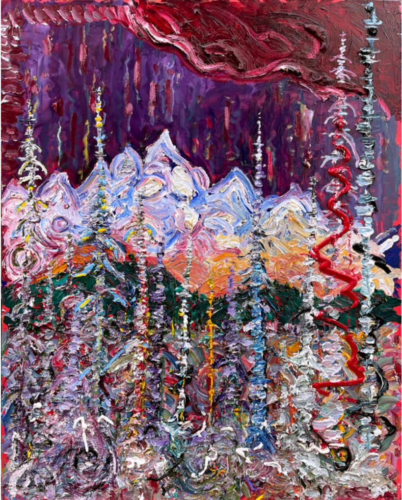
SKIERS' DREAM 2022 40" x 50" Oil on canvas / Huile sur toile