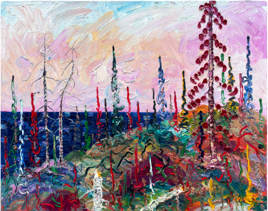
DEEP WATERS 2007 30" X 38" Oil on canvas/ Huile sur toile