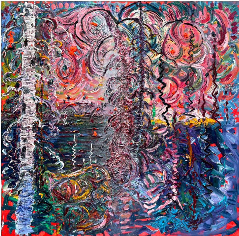
LAURENTIENS II 2022 60" x 60" Oil on canvas / Huile sur toile

Exposition: 25 Octobre - 30 Novembre 2022