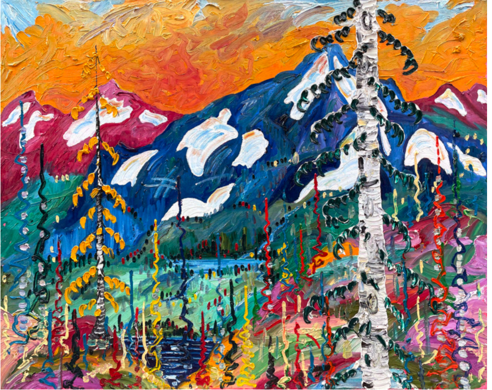
TWO LAKES, ROCKIES 2006 40.25" x 50.25" Oil on canvas / Huile sur toile