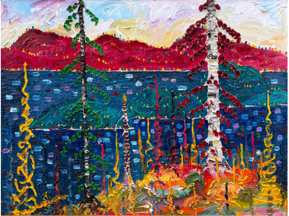
ISLAND STRING 2006 36" x 48" Oil on canvas / Huile sur toile