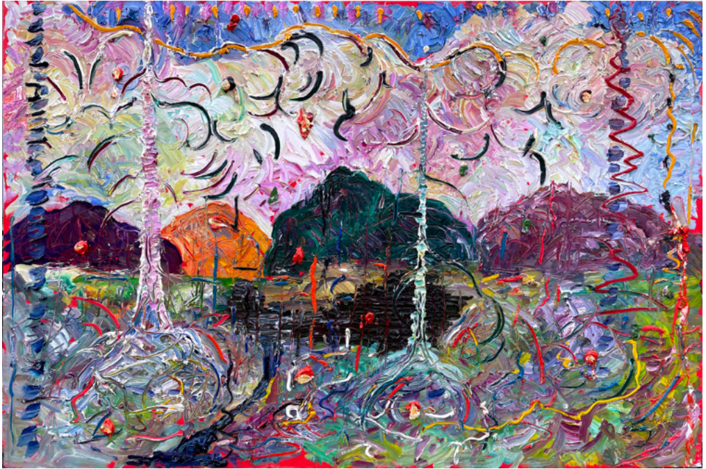
GREEN MOUNTAIN 2019 44" x 66" Oil on canvas / Huile sur toile